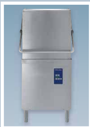
Hood type dishwasher aesthetic