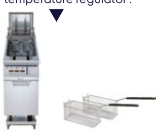
High Productivity Fryer