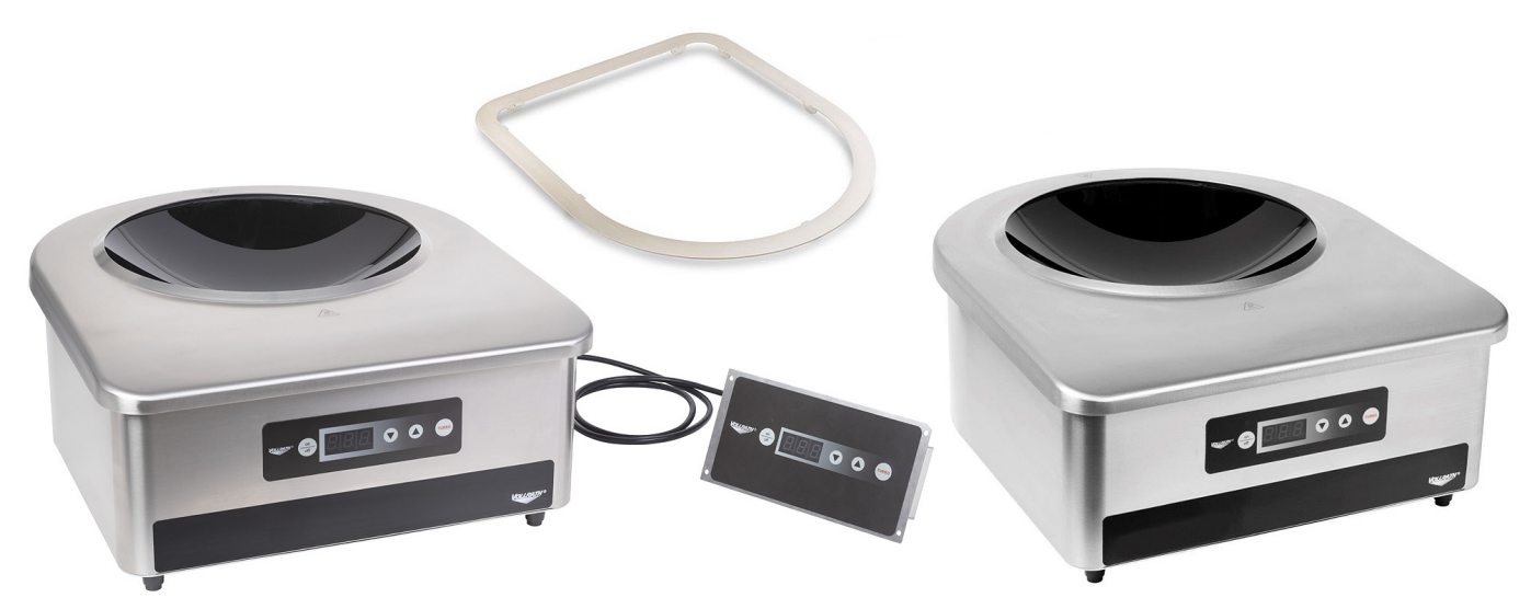
Drop-In Model shown with accesory kit - purchase separately.