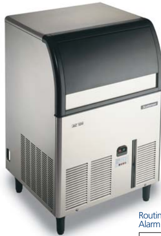
Routine Maintenance Alarm