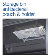
Storage bin antibacterial pouch & holder