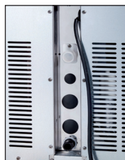
Recessed Connections Panel