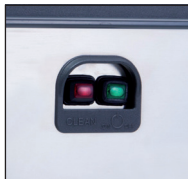
Front ON-OFF Switch