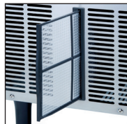
Proximity condenser air filter