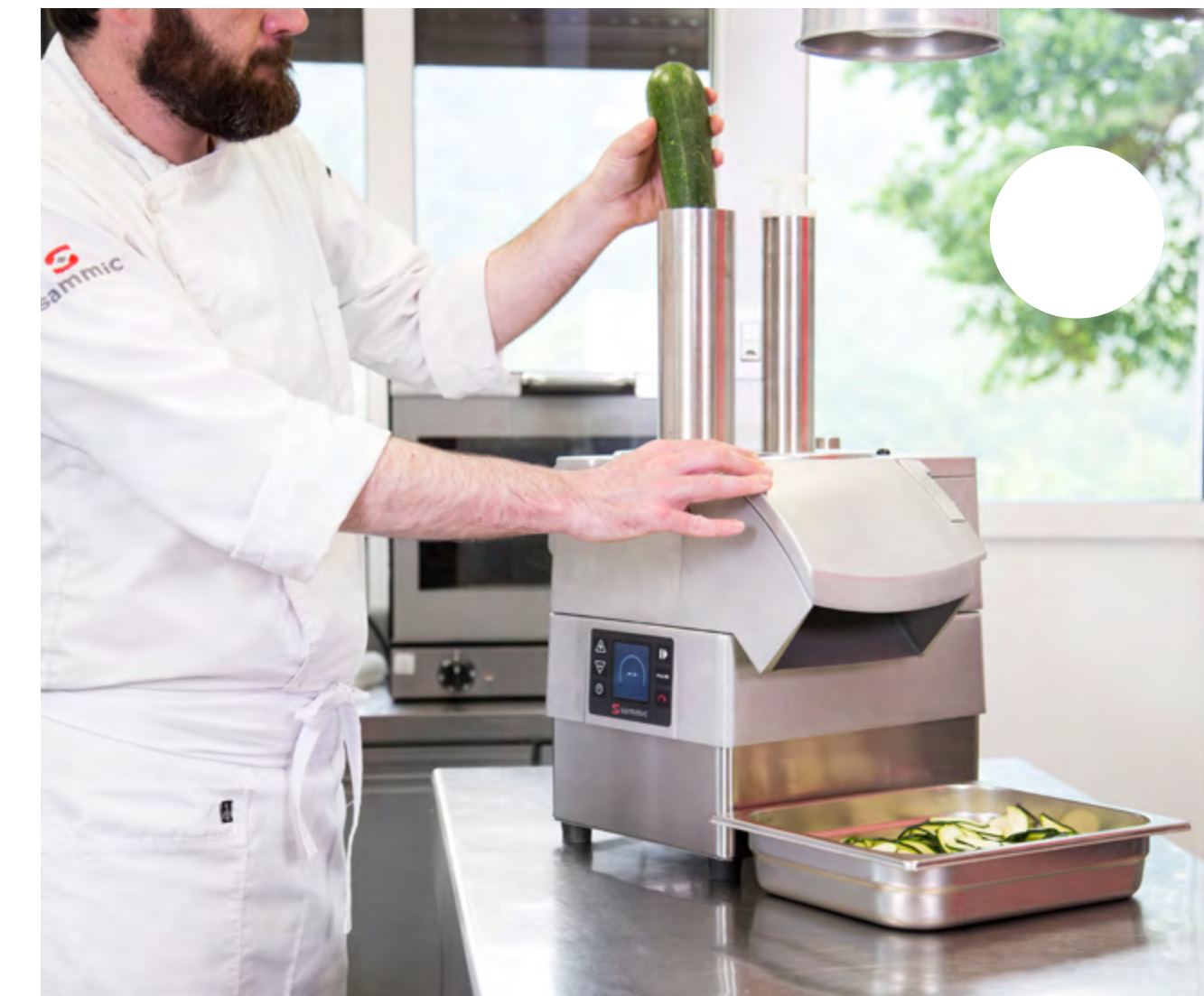
Long vegetable attachment