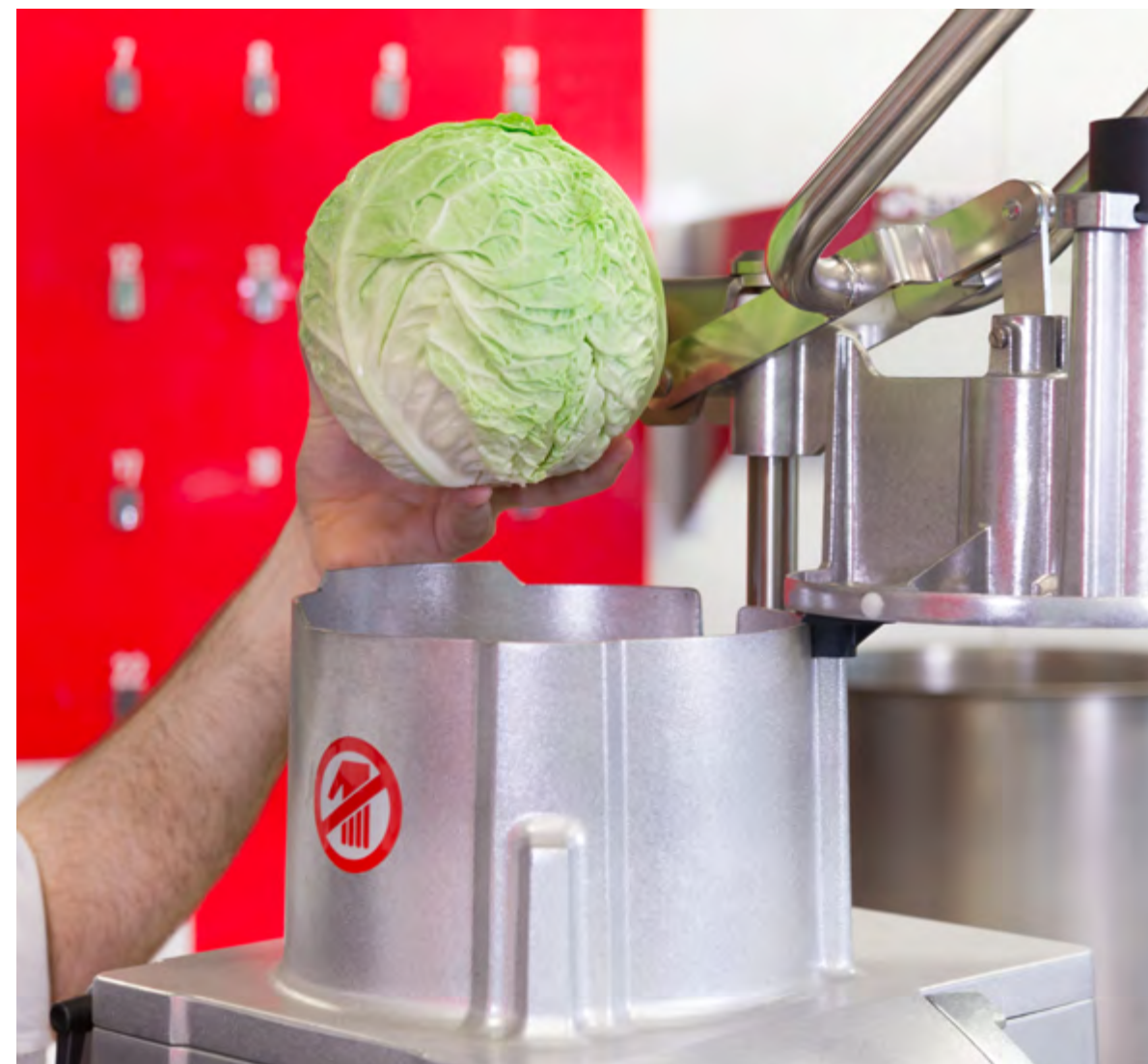
Large Capacity Attachment