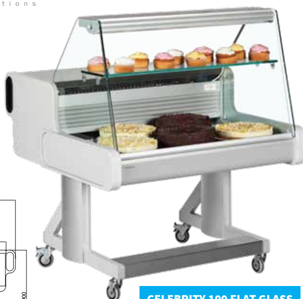
CELEBRITY 100 FLAT GLASS