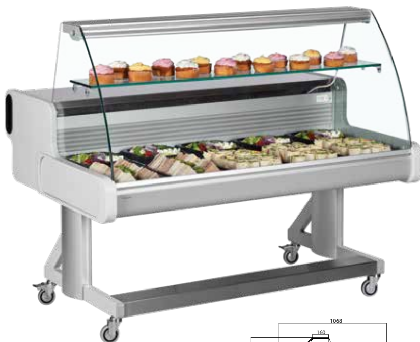
CELEBRITY 150 CURVED GLASS