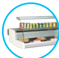
Unit can be used without trolley