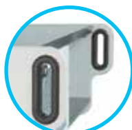
Rear of Unit