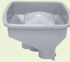
Hopper feed head

An easy solution for making large amounts of top-quality, flavoursome mashed potato.