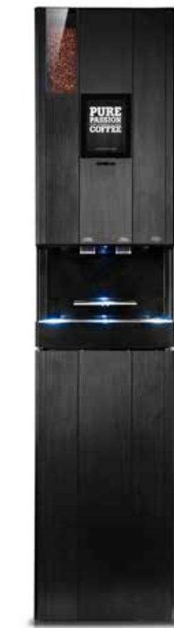
CQube LF13 Touch Screen with base cabinet