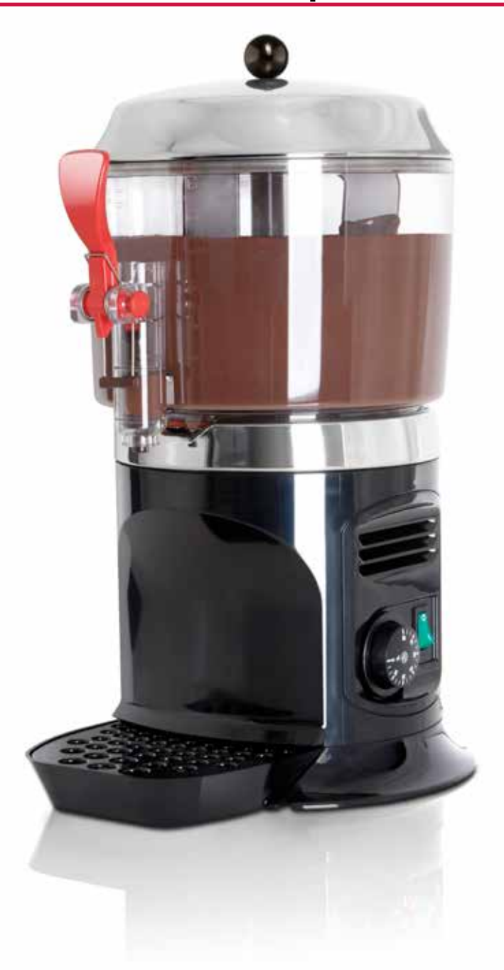
Removable bowl for ease of cleaning