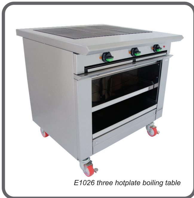
E1026 three hotplate boiling table