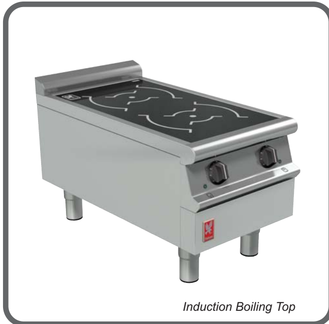
Induction Boiling Top