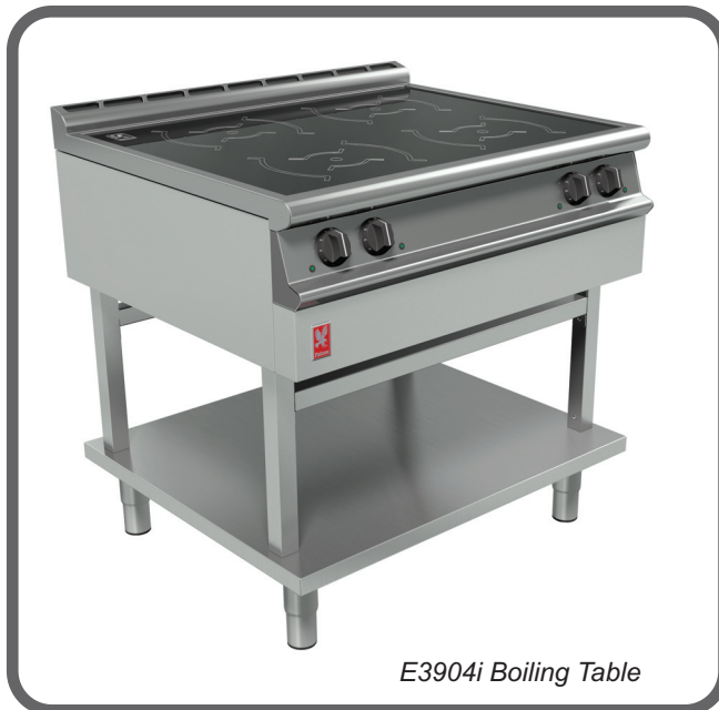
E3904i Boiling Table