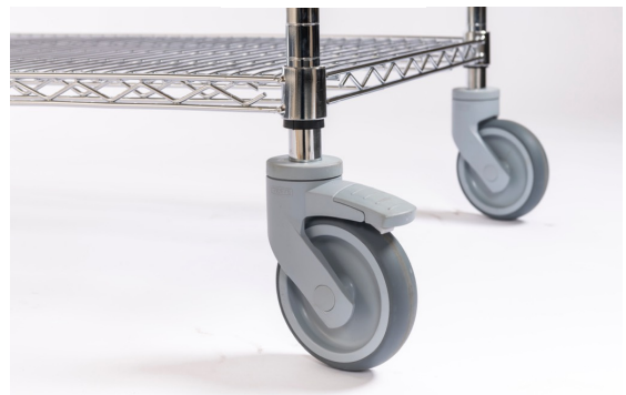
Shows mobile unit