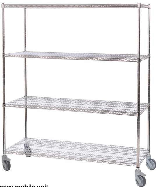
Shows mobile unit