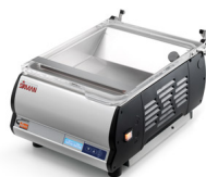
Easyvac 30 BX