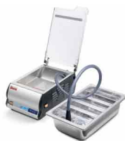
Optional tube for external air extraction