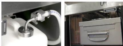
Oil replenished automatically from JIB for multi-well (left) or reservoir for 1-well (right)

Henny Penny Evolution Elite® open fryers use innovative filtering and oil level technology to extend oil life, improve product quality and reduce overall oil consumption and costs. Here's how: