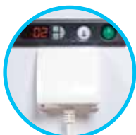
Digital Control and 13 Amp Socket for Scales or Till