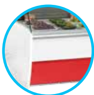
Red Trim Option