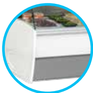
Grey Trim Option