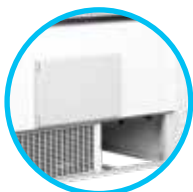
Rear Understorage Clear Opening 450x250mm per door