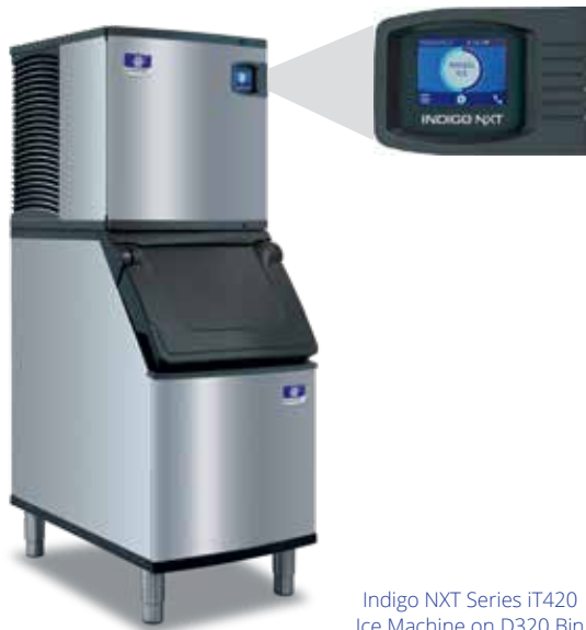
Indigo NXT Series iT420 Ice Machine on D320 Bin

Designed for operators who know that ice is critical to their business, the Indigo NXT Series ice machine's preventative diagnostics continually monitor itself for reliable ice production. Improvements in cleanability and programmability make your ice machine easy to own and less expensive to operate.