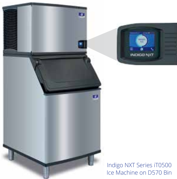
Indigo NXT Series iT0500 Ice Machine on D570 Bin

Designed for operators who know that ice is critical to their business, the Indigo NXT Series ice machine's preventative diagnostics continually monitor itself for reliable ice production. Improvements in cleanability and programmability make your ice machine easy to own and less expensive to operate.