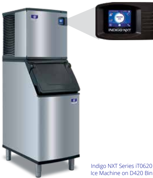
Indigo NXT Series iT0620 Ice Machine on D420 Bin

Designed for operators who know that ice is critical to their business, the Indigo NXT Series ice machine's preventative diagnostics continually monitor itself for reliable ice production. Improvements in cleanability and programmability make your ice machine easy to own and less expensive to operate.