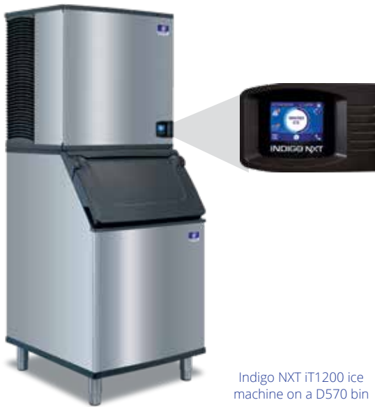
Indigo NXT iT1200 ice machine on a D570 bin

Designed for operators who know that ice is critical to their business, the Indigo NXT Series ice machine's preventative diagnostics continually monitor itself for reliable ice production. Improvements in cleanability and programmability make your ice machine easy to own and less expensive to operate.