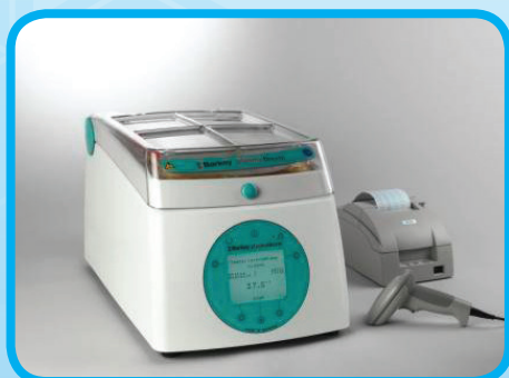
Optional bar code reader and printer