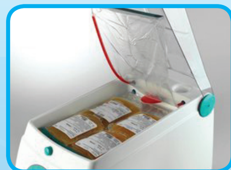
Easily holds 4 bags of plasma