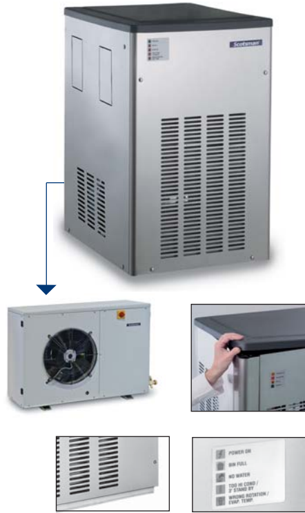
Stainless Steel Electronic Controls