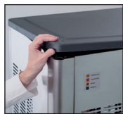
PS plastic top cover