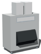
2xMF 69+UBH1100 (sold separately)