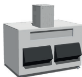
MF 69+UBH2250 (sold separately)