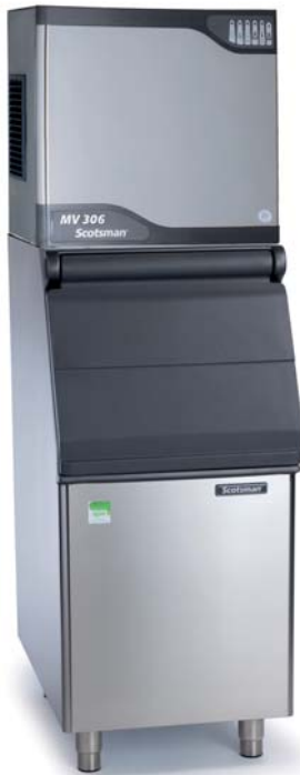
MV 306 with SB322 (sold separately)