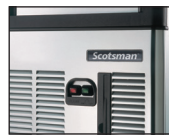
Front ON-OFF Switch Routine Maintenance Alarm