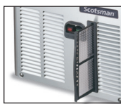
Proximity condenser air filter