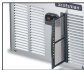
Proximity condenser air filter