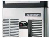
Front ON-OFF Switch Routine Maintenance Alarm