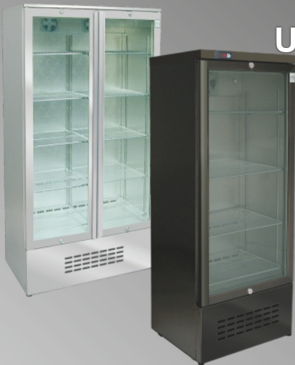
Upright Chiller Range