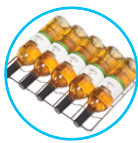
Wine shelves available as optional extra POA