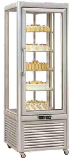
PRISMA 400RS Rotating silver