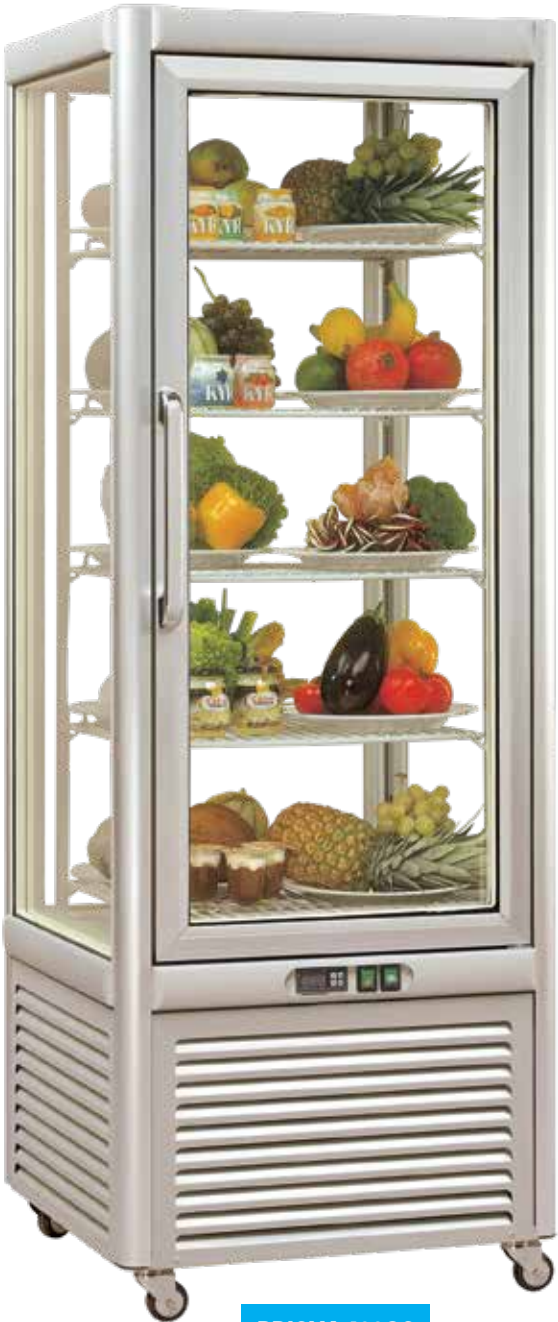
PRISMA 400QS Wire shelves silver