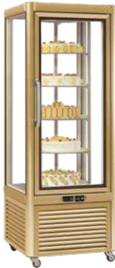
PRISMA 400RG Rotating gold

Prisma 800 double door still available. Go to www.interlevin.co.uk