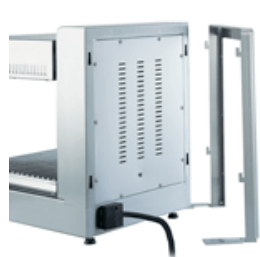
Wall mounted support optional