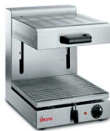
PRO 1/2 G