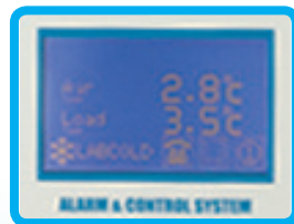
Hygienic touch screen controller

An asymmetric change over ensures even distribution of workload, resulting in even wear of the compressors and also allows for one to defrost while the other is still running. The two independent systems provide back up should an issue develop plus there is no need to move contents immediately if a problem is identified. Designed and manufactured in the UK in our Basingstoke factory, this Blood Bank refrigerator is a certified Medical Device in accordance with Directive 93/42/EEC and is compliant with BS4376:Part 1:1991.