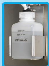
Temperature load bottle

Labcold blood banks are tested for 72 hours and calibrated in our UKAS calibration laboratory No:8898 before they are dispatched and all come with a FREE 2 year parts and labour warranty.