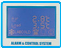
Hygienic touch screen controller

Designed and manufactured in the UK in our Basingstoke factory, this Blood Bank refrigerator is a certified Medical Device in accordance with Directive 93/42/EEC and is compliant with BS4376:Part 1:1991, this blood bank is fitted with safety features such as a seven day chart recorder to keep you in the knowledge that your product is stored correctly and safely.