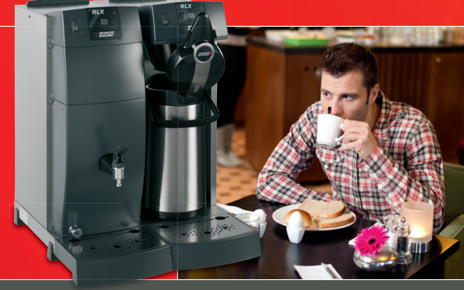
The taste of quality worldwide