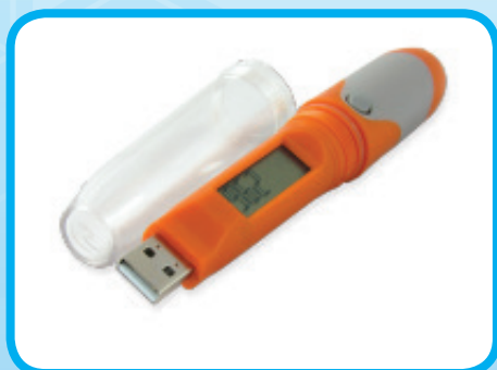
Easy to use USB data logger RMBL51TA