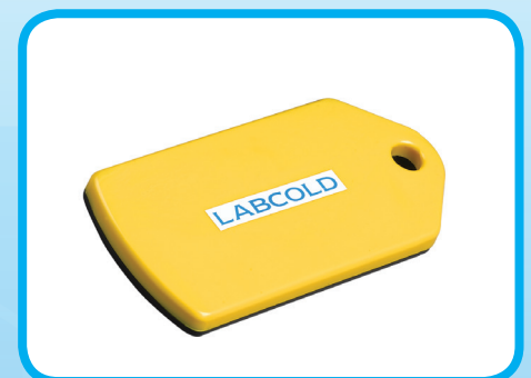
Transport logger RMBL1510