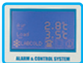
Hygienic touch screen controller

Fitted with a Dual Compressor to ensure greater temperature control and peace of mind in the event of failure of one of the systems. Each complete refrigeration system provides 100% performance, sufficient to cool down and maintain temperatures correctly without help from the second compressor.