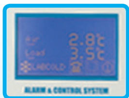
Hygienic touch screen controller

Fitted with a Dual Compressor to ensure greater temperature control and peace of mind in the event of failure of one of the systems. Each complete refrigeration system provides 100% performance, sufficient to cool down and maintain temperatures correctly without help from the second compressor.