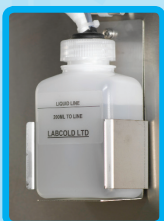
Temperature load bottle

Labcold blood banks are tested for 72 hours and calibrated before they are dispatched and all come with a FREE 2 year parts and labour warranty.