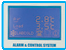
Hygienic touch screen controller

An asymmetric change over ensures even distribution of workload, resulting in even wear of the compressors and also allows for one to defrost while the other is still running. The two independent systems provide back up should an issue develop plus there is no need to move contents immediately if a problem is identified.