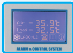
Hygienic, easy to read display and controller

Featuring a Labcold wipe clean controller that displays all the information you will need including audible and visual alarms to alert you to temperature fluctuations. A factory fitted 7 day chart recorder keeps you in the knowledge that your product is stored correctly and safely. For added security a door lock is fitted and is supplied with two keys.