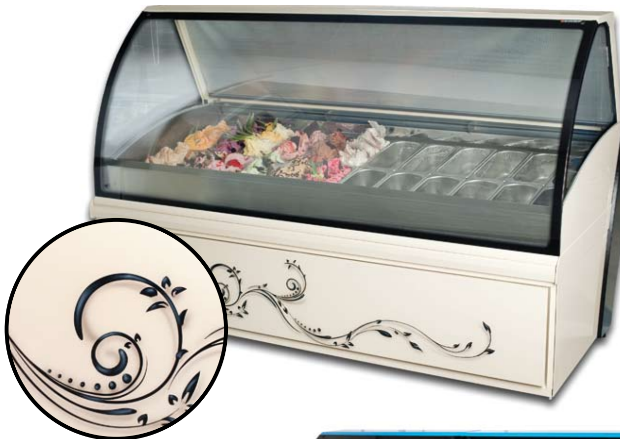
Custom hand painted front panel

Matches with Carina Patisserie (see pages 17 - 18)