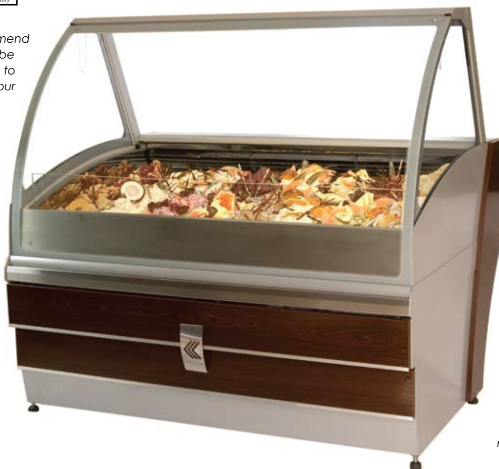
Image shows mahogany finish

We recommend Sagittas to be connected to a 16amp Spur