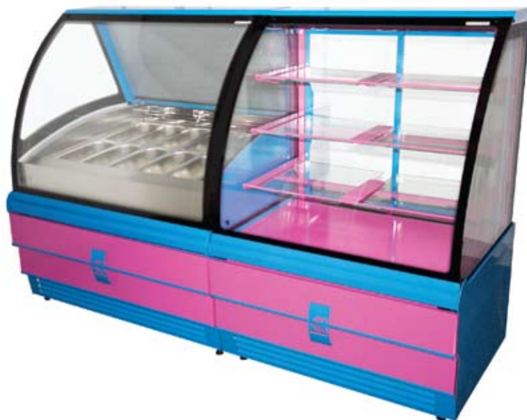
Customised models also available. Image shows SAG12 and CAR/10R