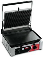
CORT L Timer