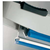
Cutter on mod. S400/2T