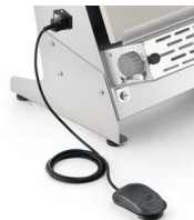
Optional pedal controls for Plus versions