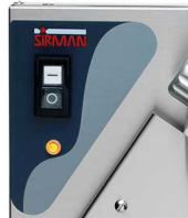
Standard versions with IP 54 controls