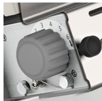
Adjustable thickness by plastic knobs