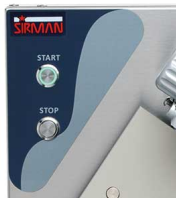
Plus versions with IP 67 stainless steel controls