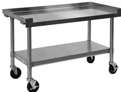
Medium Duty Cookline Stand