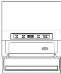
OUTER DIMENSIONS Toucan 42