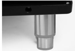
Adjustable legs (from 101-152mm) available with optional leg kit K-00345.