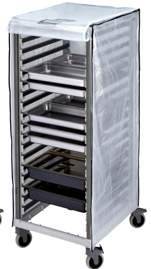
GBCTUGNPR21 Optional Heavy Duty Vinyl Cover for GN 2/1 Full Size Trolley.