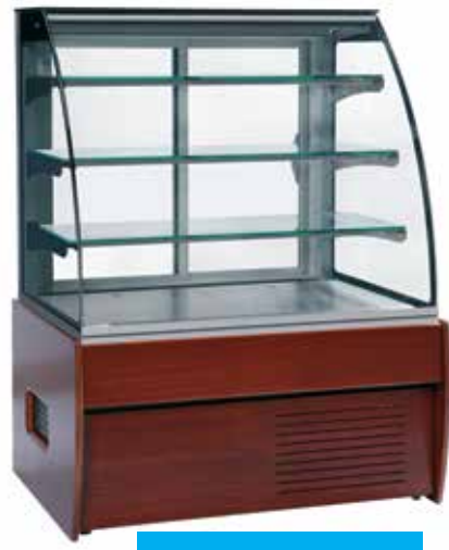
ZURICH II 100W CHOC