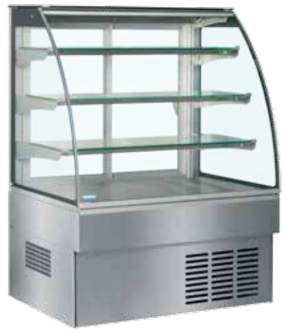
ZURICH II 100SS CHOC