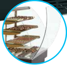
Hinged front glass for cleaning