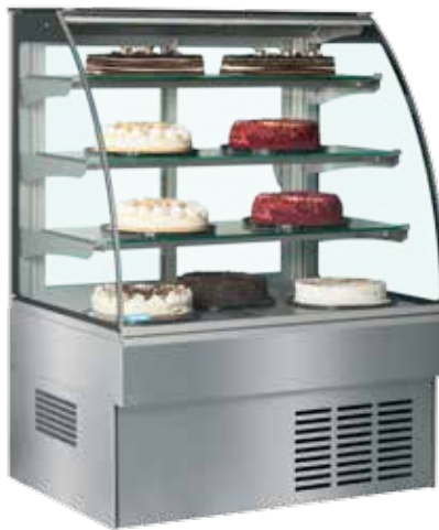
ZURICH II 100SS