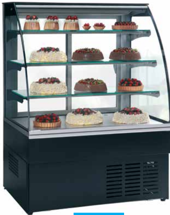
ZURICH II 100